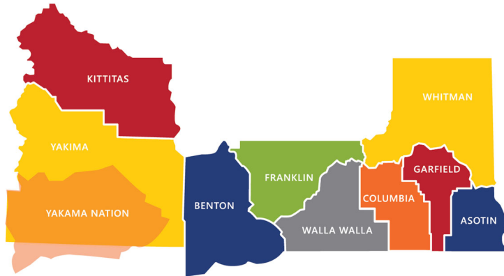
GCACH's nine-county region